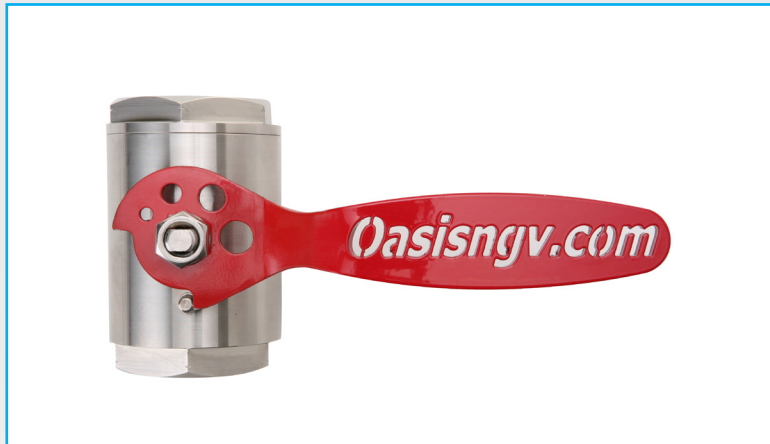
BV708-4N6LDDN-1000 - 1" Ball Valve

Suitable for use with CNG, Helium, Bio-Gas, Nitrogen, Air and other gases on enquiry.