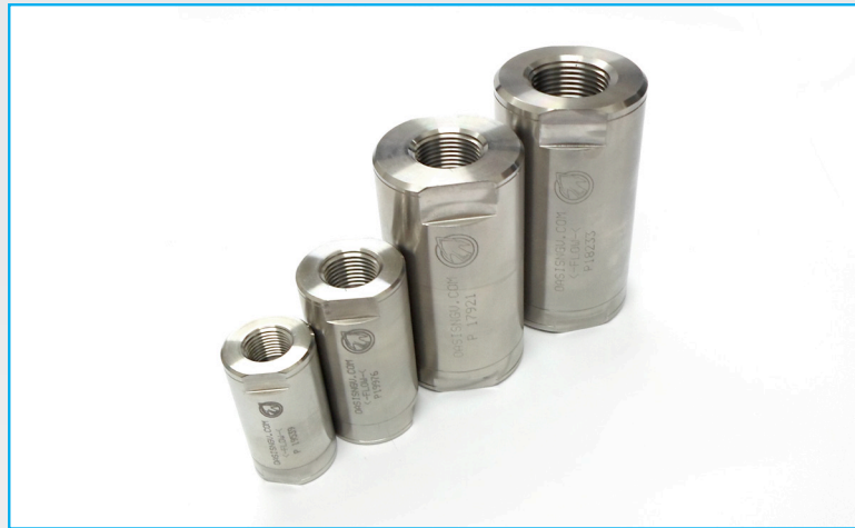
Check Valves 200 Series

Unidirectional flow applications such as CNG Dispensers, Fill Panels, Priority Panels, Compressors, Trailers and Service Stations. Suitable for CNG, Helium, Bio-Gas, Nitrogen, Air and other gases on request.