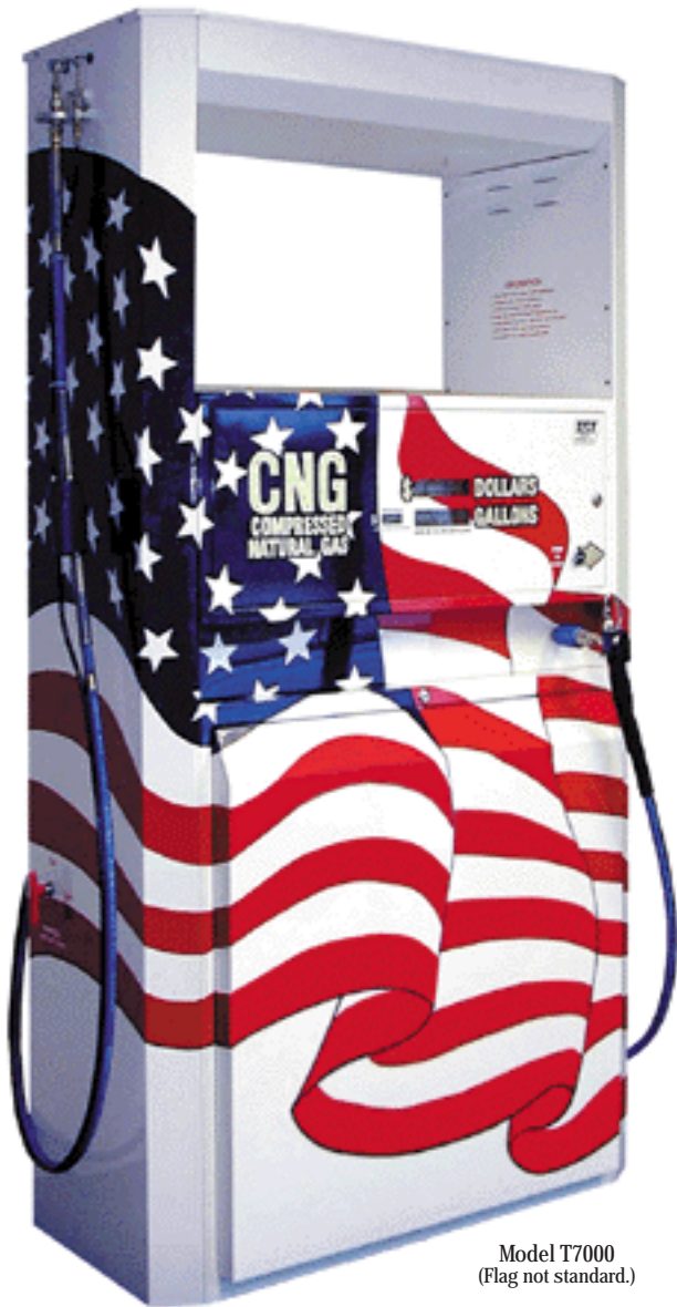
Model T7000 (Flag not standard.)