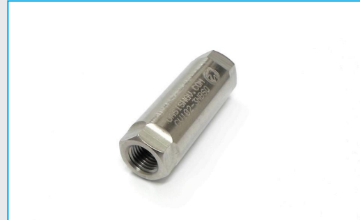
CV102-3NBSO - Check Valve 1/4"