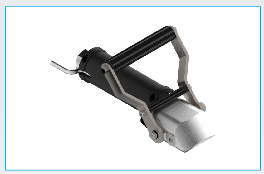
FV103-4-00A-0 45° Fill Valve

CNG and Bio-Gas Dispensers for Car, Bus and Truck filling & CNG Bio-Gas Trailer load/unload systems.